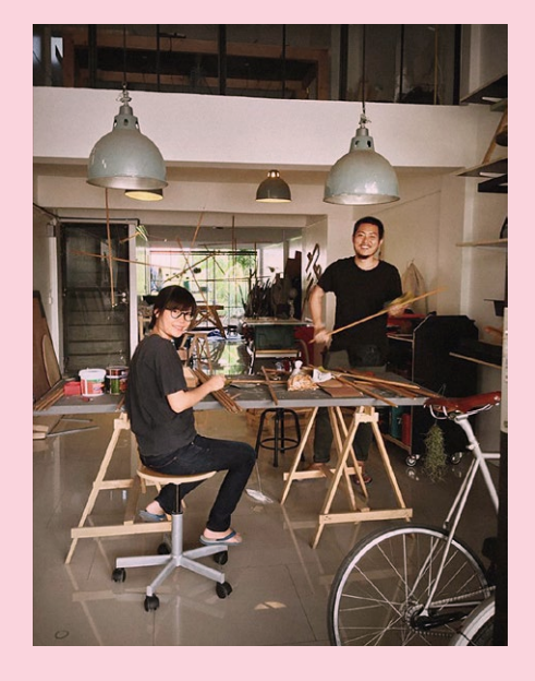
"We felt the need to make room inside for the nature that surrounds us."